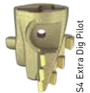
S4 Extra Dig Pilot